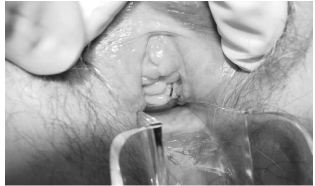
FIGURE 2. Vaginal extrusion of Mentor ObTape mesh. Note midline marking of mesh clearly visible on introital examination.

the use of the Mentor ObTape sling and report a high rate of defective vaginal healing and vaginal mesh extrusion.